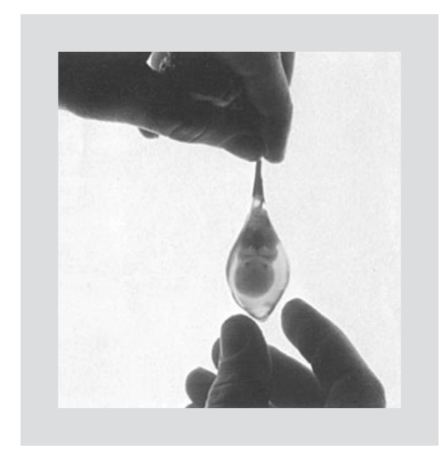
Figure 1. This extraordinary picture of an embryo inside its intact amniotic sac was taken, after a surgery that was required owing to an ectopic pregnancy (in the fallopian tube), by the doctor and photographer Robert Wolfe at the University of Minnesota, USA, in 1972.

before natural growth of the embryo or fetus tears the tube walls and produces abundant bleeding and death of the fetus and probably also of the mother if she does not receive attention immediately in a hospital unit.